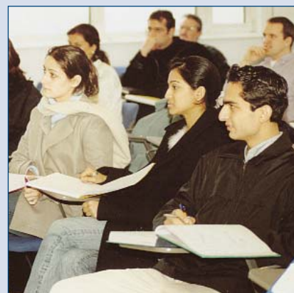
Students on a study weekend at the LSE

The External Programme website has a special area devoted to students taking programmes led by LSE which offers a growing range of online support, including booklists and reading updates, exam reports and past papers. LSE also offers students an annual study weekend in February for all subject areas.